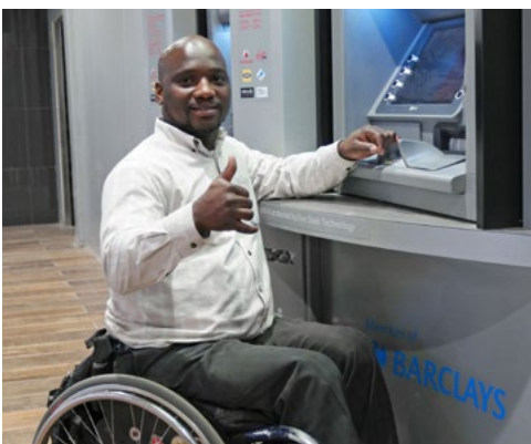
Man at ATM: Example of accessible ATM for persons using wheelchairs and that is short of stature

The National Council of and for Persons with Disabilities (NCPD) is a leading disability organisation with 85 years' experience of enabling, supporting and enhancing the quality of life for Persons with Disabilities.