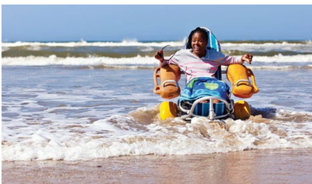
Example of a person with a mobility impairment using a beach wheelchair (Amphibious Wheelchair) to access and enjoy the ocean.