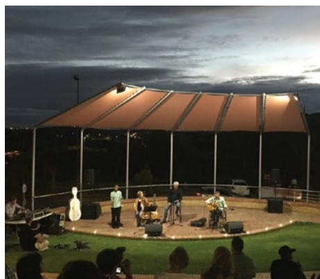
The Amphitheatre at UNISA Pretoria main campus (Muckleneuk) was made accessible to persons with mobility impairments by providing step free access and persons with hearing loss by installing an induction loop system.