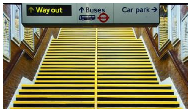
Example of good colour contrast on steps for persons with vision impairments