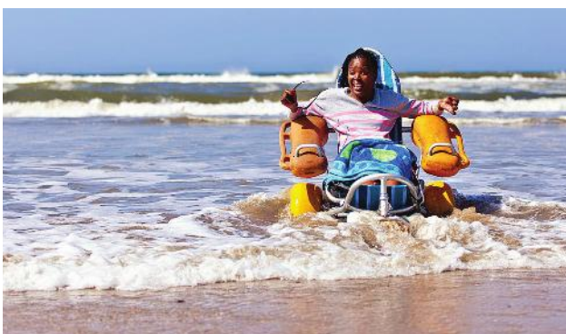
Example of a person with a mobility impairment using a beach wheelchair (Amphibious Wheelchair) to access and enjoy the ocean.