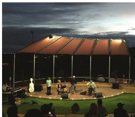
The Amphitheatre at UNISA Pretoria main campus (Muckleneuk) was made accessible to persons with mobility impairments by providing step free access and persons with hearing loss by installing an induction loop system.