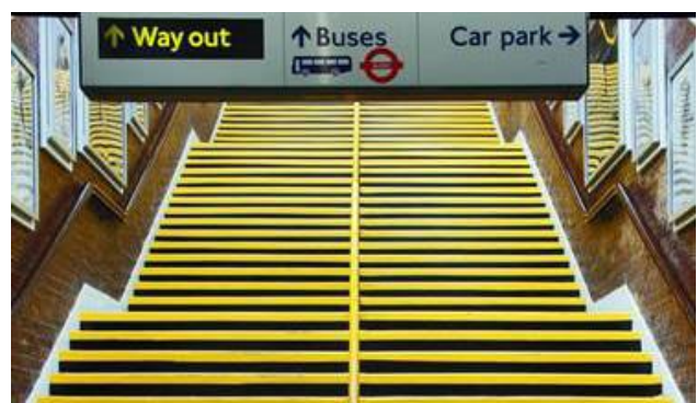
Example of good colour contrast on steps for persons with vision impairments